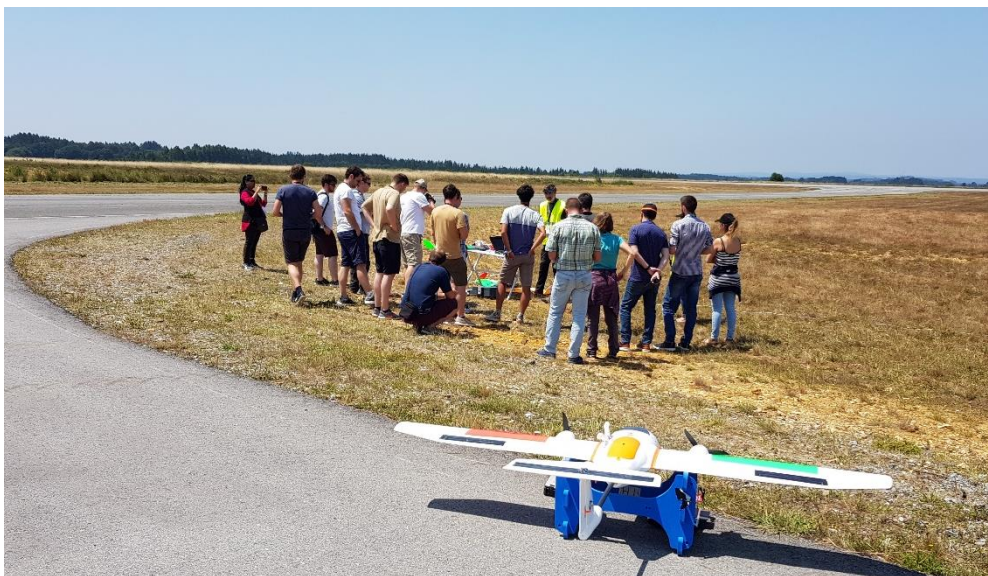
Fig. 5: Drones are ready to take off