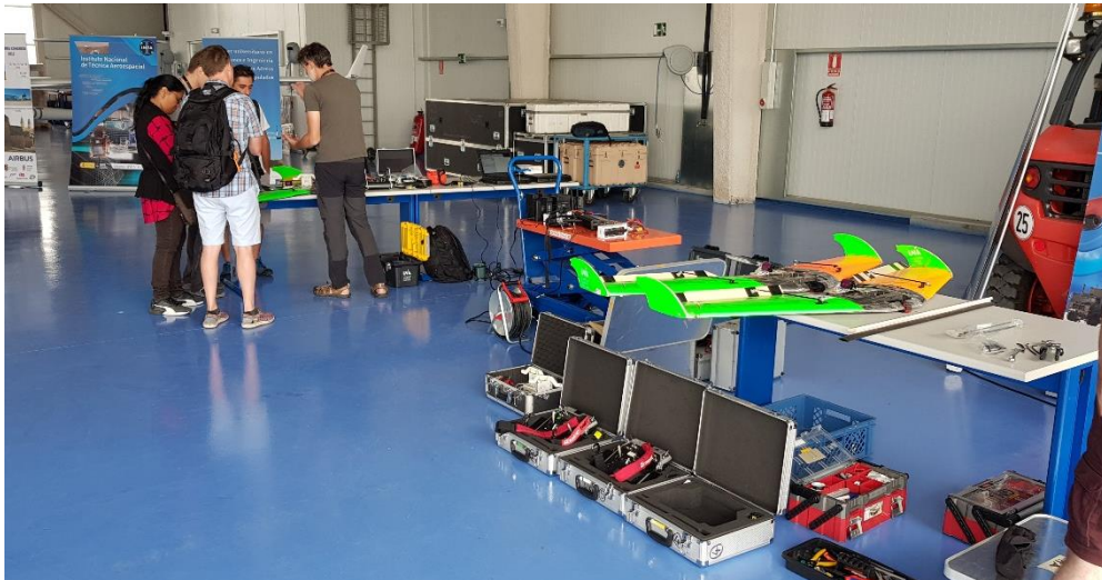
Fig. 4: Preparation for the flight