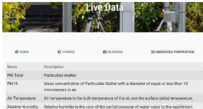
Fig. 3: View of Observed Properties

Under Observed Properties the different data types (PM2.5, PM10, temperature, humidity and others) are displayed.