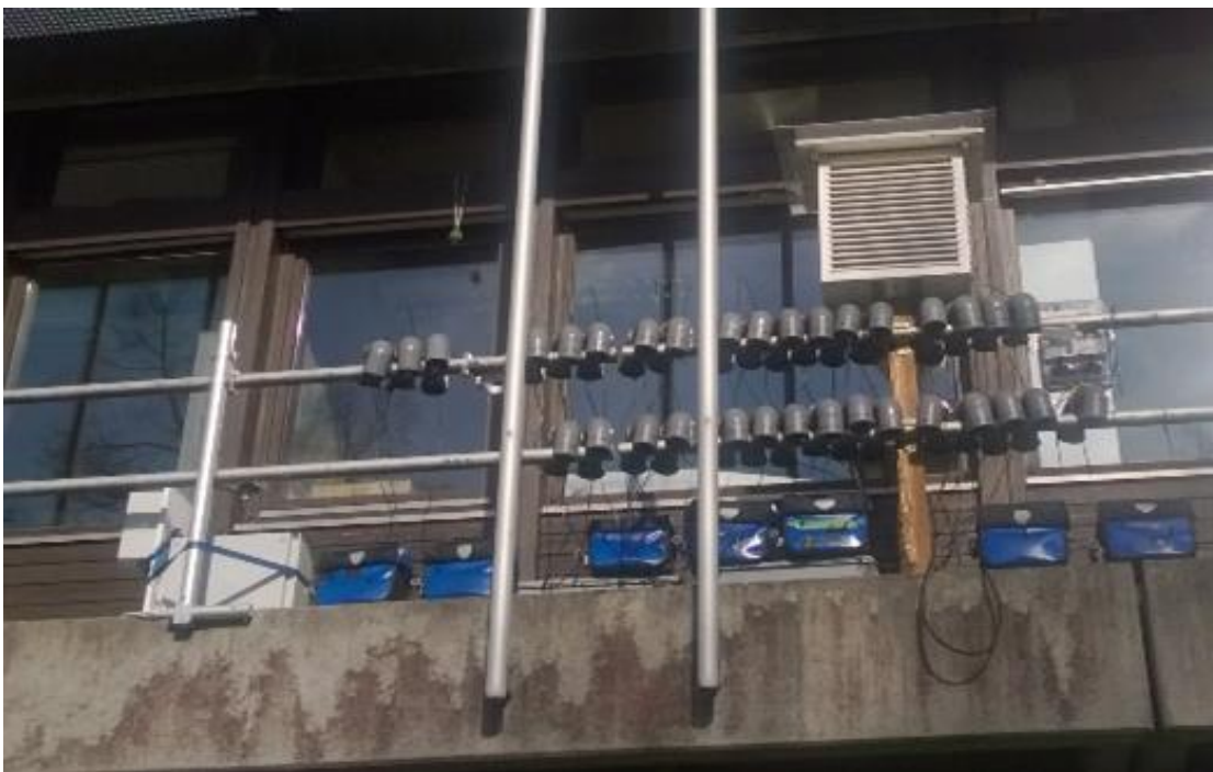
Fig. 1: Comparative measurements of the 30 SDS011 sensors and bicycle bags at the Institute of Geography.

The comparative measurements of the 30 SDS011 sensors and the new bicycle bags have been completed. On April 24, a workshop was held for volunteers. Four bicycle bags and 9 SDS011 sensors were distributed to the 10 participants.